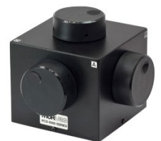
Click to Enlarge Axis Control Unit

Each knob controls a three-turn potentiometer, which regulates voltage to the piezo flexure assembly and thus its position. Three turns correspond to the full travel range of the piezo assembly, yielding a resolution that is 0.04% of the total piezo travel range. For example, a 150 \mu\text{m} piezo travel stage will have a 60 nm resolution provided by the axis control unit. Additionally, the user may set the potentiometer friction to suit experimental needs.