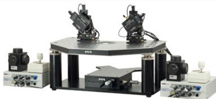
Custom Motorized Micromanipulators Mounted on Our Gibraltar GHB-BX Platform (See Custom Options Tab for More Details)