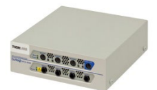
Click to Enlarge 60 V Power Supply

Control of the stepper motors is accomplished through the use of the included joystick. The joystick offers analog control allowing the motorized assembly speed to be controlled continuously between 0.5 nm/s to 2 mm/s and offers a minimum step size of 1.6 \mu\text{m} . Joystick control allows the user to store up to two independent positions in memory and gives simple push button recall to said positions. This allows the user to quickly and reliably switch between two preset positions.