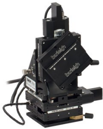
Click to Enlarge Micromanipulator Assembly